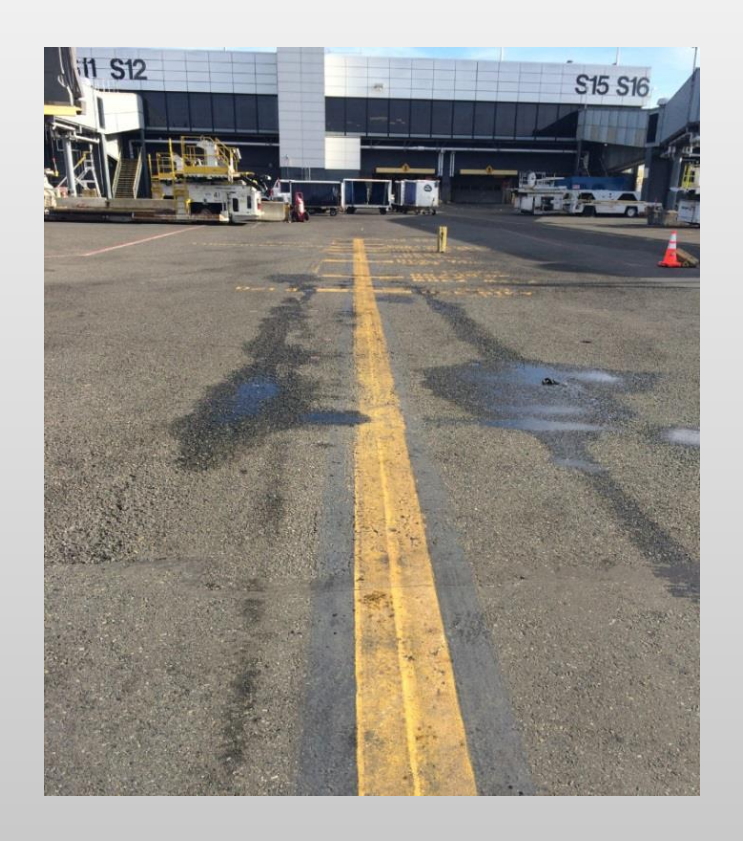
Failed Asphalt Pavements at South Satellite